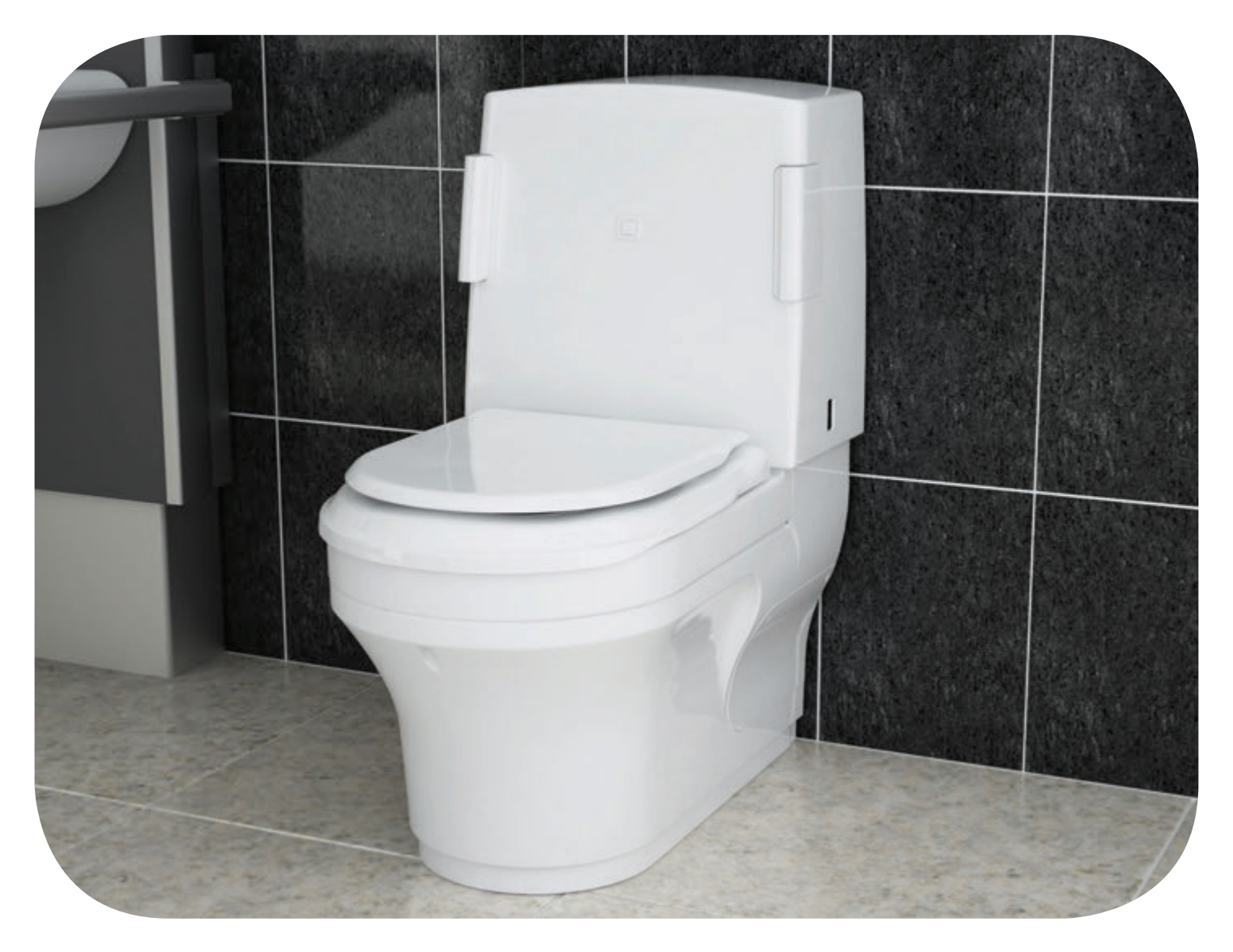
Palma Vita wash & dry toilet